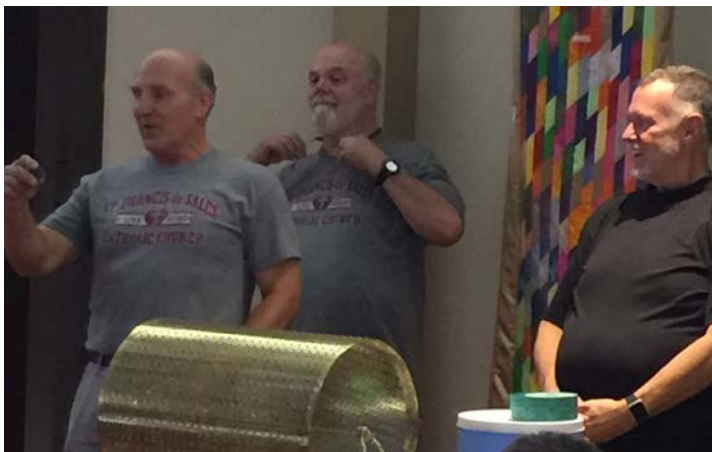
St. Francis de Sales that split over $1,000 with the lucky winner.