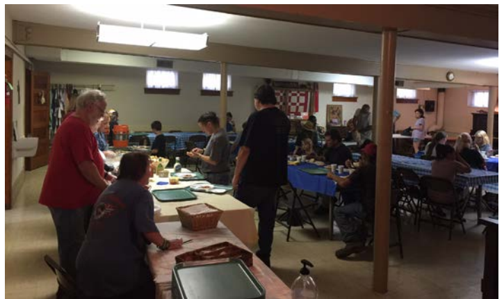
Nearly 500 meals served on 14 September, consider supporting next month.