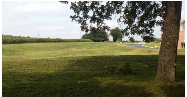
Looking good for Church activities and Lansing Fall Festival.