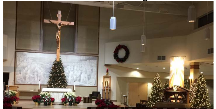
Best Christmas Decorations Ever