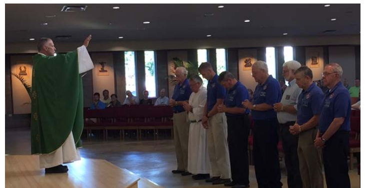
Father Bill provided a blessing to the new council officers: "Help us to be the finest example of complete dedication to the practice of Christian principles."